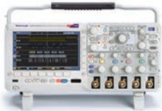
MSO2024B Mixed Signal Oscilloscope 200 MHz, 4 analog + 16 digital channels

Each demo kit includes the standard probes and accessories for the instrument, a documentation CD, demo board or test target, and a detailed instructional guide.