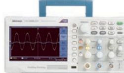
TBS1202B-EDU Oscilloscope 200 MHz, 2 analog channels