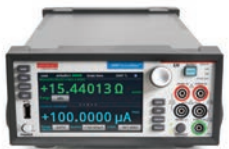
2450 SourceMeter ® SMU SMU +/- 200V, +/- 1A, 20 W, 6.5 digit DMM