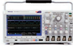
MDO3104 Mixed Domain Oscilloscope 1 GHz, 4 analog + 16 digital channels 3 GHz Spectrum Analyzer