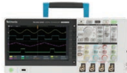
TBS2104 Oscilloscope 100 MHz, 4 analog channels