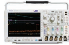
MDO4104C Mixed Domain Oscilloscope 1 GHz, 4 analog + 16 digital channels 50 MHz AFG, 3 or 6 GHz Spectrum Analyzer