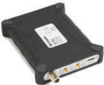
RSA306B USB Spectrum Analyzer 9 kHz to 6.2 GHz frequency range +Signal Vu-PC signal analysis software